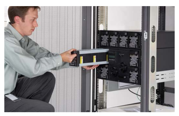
Modular, lightweight design allows for easy installation and service