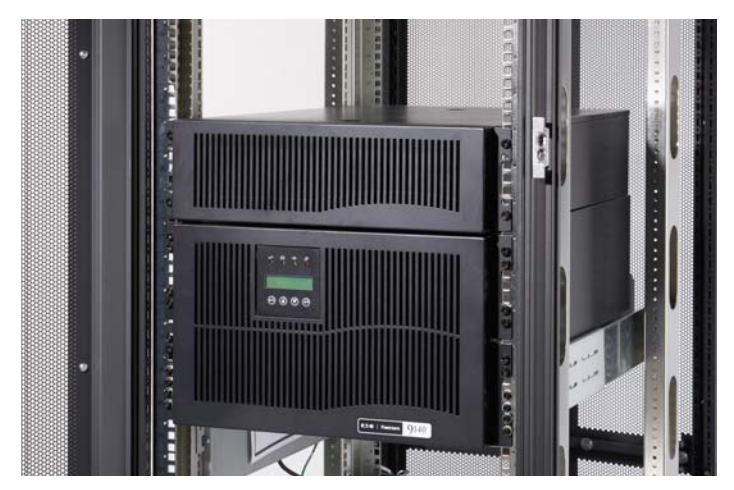
The Powerware 9140 UPS and one EBM occupy only 9U of rack space.